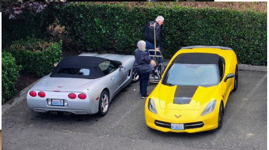
below: Three Corvettes park in front of the building housing The Spruce Goose