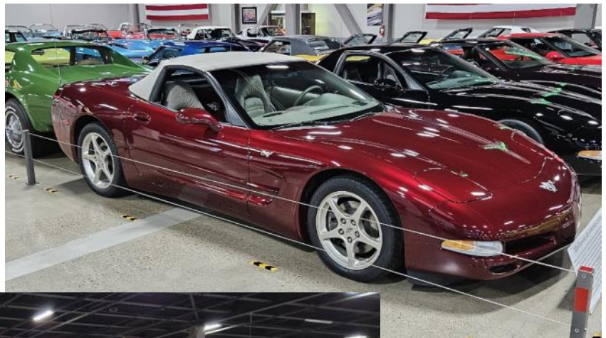
this 2003 Anniversary Edition was stunning

The weather continued to turn and the drive home on I-5 was non-stop rain which was heavy in certain areas. Nevertheless, we all made it home without incident