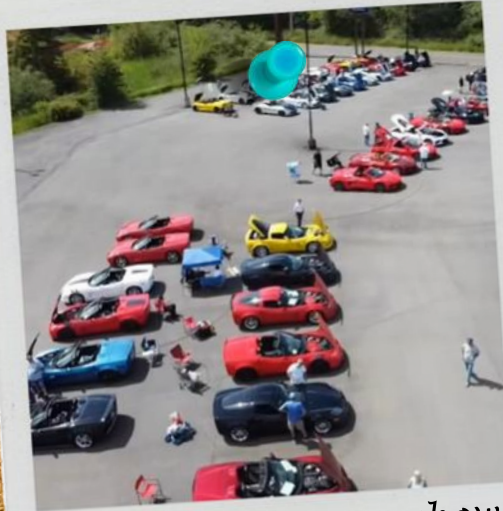
A shot from our car show at Gilchrist

WANTED: Newsletter Editor (see a Board member for info)