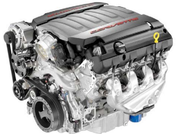
The new 2014 Gen 5 LT1 small block. GM photo

By Bruce Troxell - National Corvette Examiner