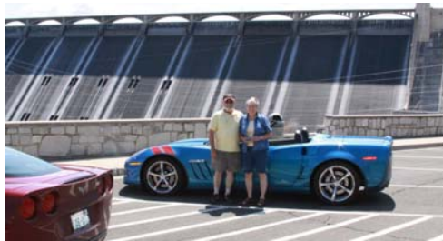
Grand Coulee Dam

Editors Note: In 1984, I proposed to my wife, Patti, on September 2nd at the Overlook Vista at the Dam. We were there for the Light Show. At that time, I owned a 1973 Corvette. We have very fond memories of the night and the damn. It is a very enjoyable drive.