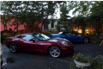
B & B Twisp, WA

This was a two night trip over the North Cascades Sally and I took back in July with friends. Stayed at a nice B&B in Twisp and had dinner in a Brew Pub that had a String Quintet for music, very unusual. The next night was another B&B after stopping at Grand Coulee Dam. The trip was 550 miles and lots of fun. Get out and put some "Rubber on the Road" and take a friend.