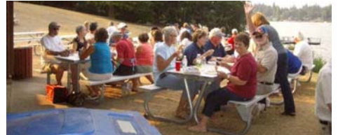
2010 Picnic at Camp McKean