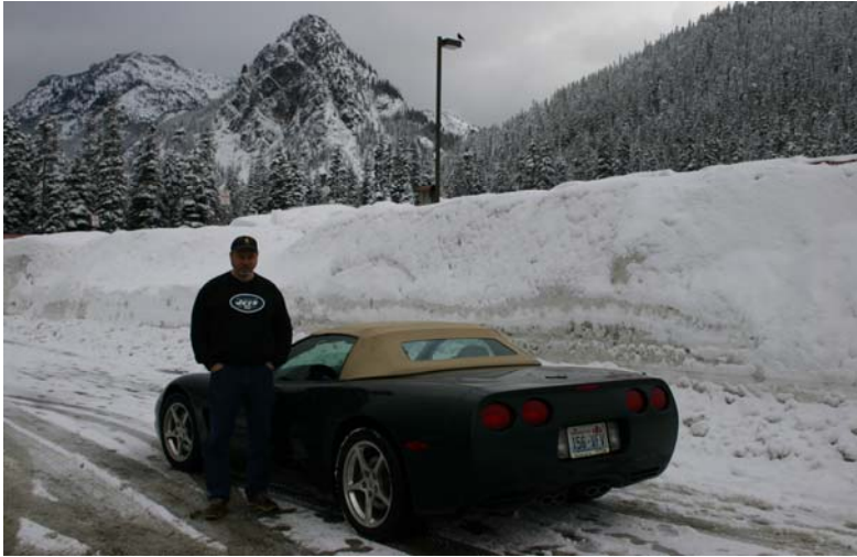
Rich's 2001 Convertible in action.